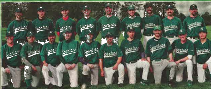
The Spartans (above) won the title at the expense of the Hurricanes (below)